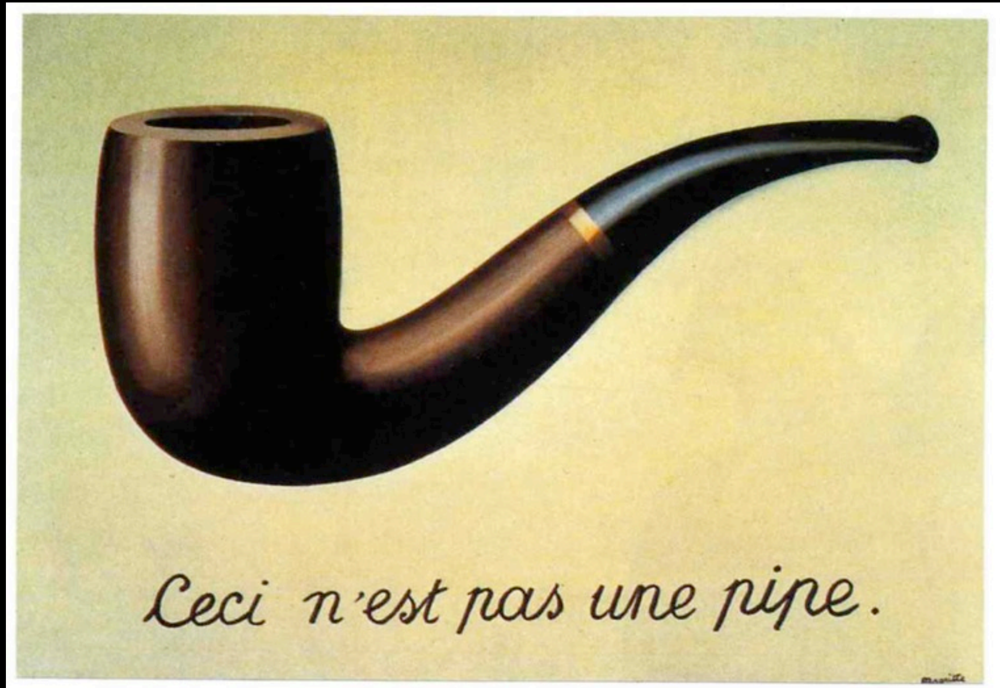
Renee Magritte, The Betrayal of Images , 1928